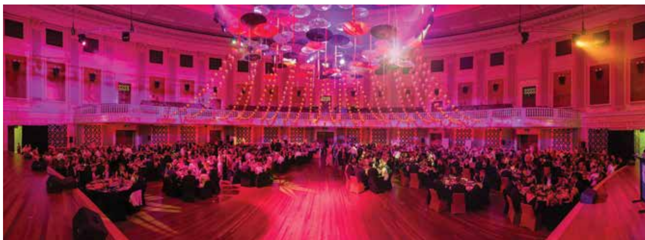
Main Auditorium City Hall

The Lord Mayor's Charitable Trust held their fundraising event of the year with a Gala Ball at City Hall on 1 March 2014. The night was a huge success with many of the 600 guests who attended dressed in the theme 'A Night in the Orient'. It was a clear and balmy night for the guests to enjoy pre-dinner drinks in King George Square, including an oriental cocktail and beer.