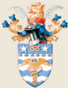
LORD MAYOR'S CHARITABLE TRUST