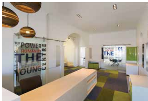
The Young Centre