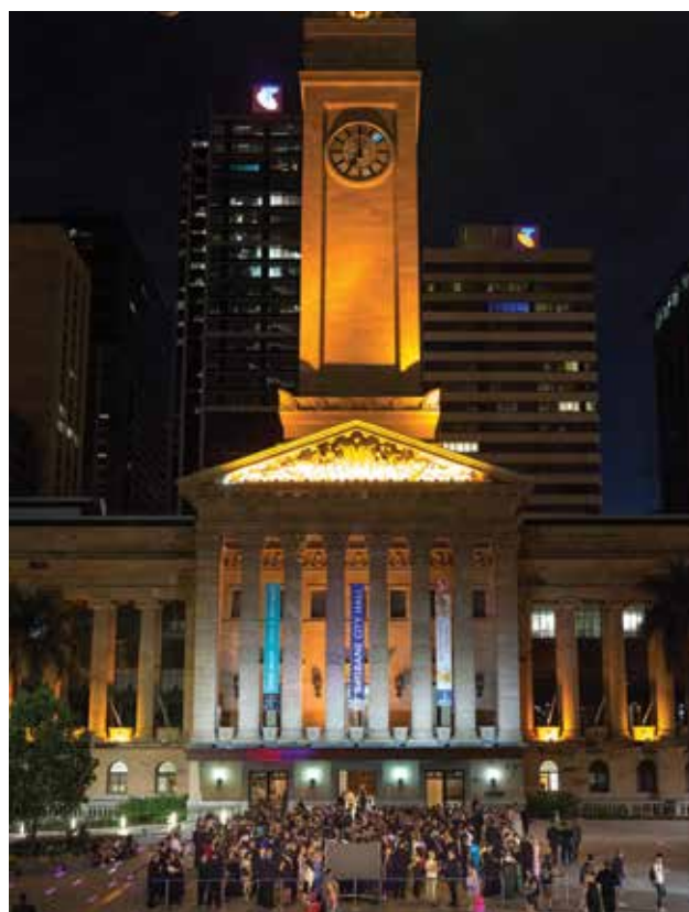
Guests enjoying pre-dinner drinks in King George Square

Thank you to all of the Gala Ball sponsors including Silverstone Developments, Channel Nine, Rowland, Brisbane City Council, Epicure, Staging Connections, Yellow Cab Co, Southern Oil, Clayton Utz, Carlton United Brewery, Coca Cola, Sarabah Estate Vineyard and Negotiants Australia. Your kind support made for a wonderful event that is fast becoming the Gala Ball that can't be missed.