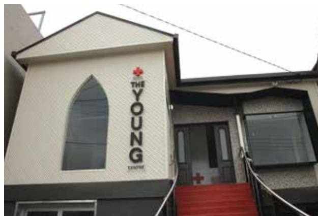
The entrance to The Young Centre located in Brunswick Street, Fortitude Valley.

From July 2013 to June 2014 there were over 1,050 visits by young people to the Young Centre with the highest percentage between the ages of 21 to 25 years of age and the next highest percentage from 18 to 20 year olds.